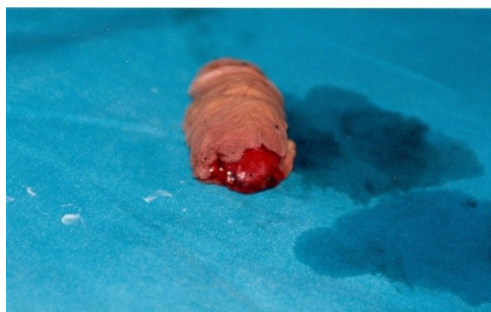
Figure 1. Complete amputation

The penis is an organ which is anatomically divided into three parts: the base of the penis, the shaft of the penis and the glans penis. The base is located below the pubic bone and it