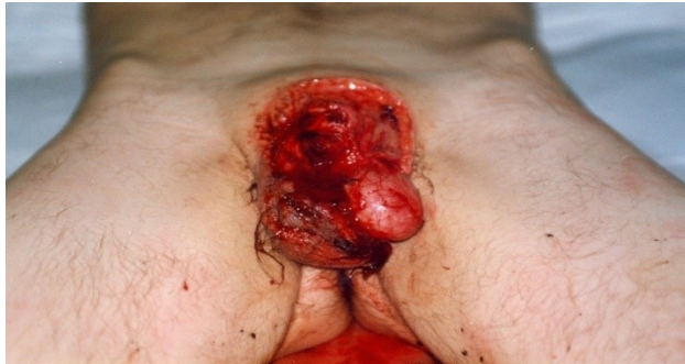
Figure 2. Amputation of the penis and open wound of the scrotum.